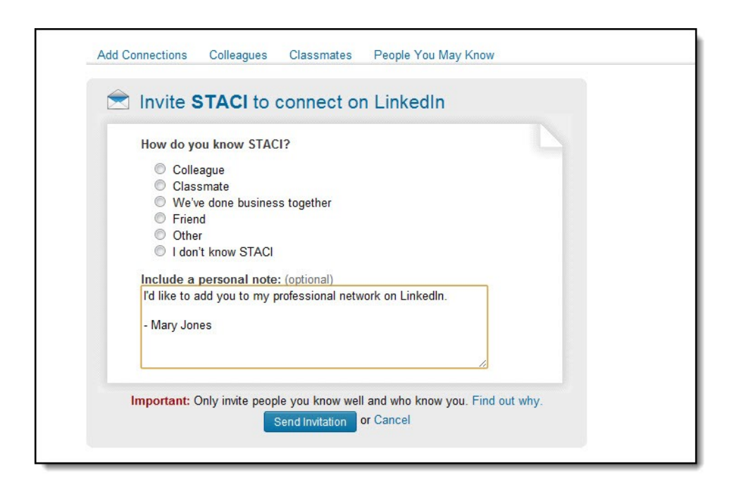
Rule # 4 : It's a very simple one: Never send people network requests ("friend" requests) without changing the default message to something more personal. This is the default message, below...

Testing has proved to many internet entrepreneurs that a better response rate is garnered when that message is personalized and a reason added.